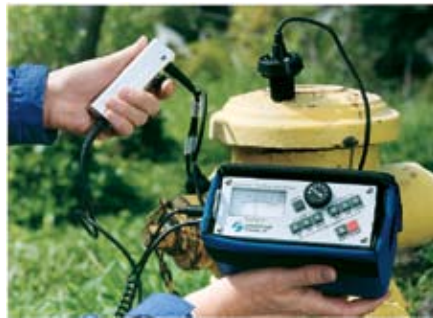
Leak Surveying by listening at a hydrant with magnet base