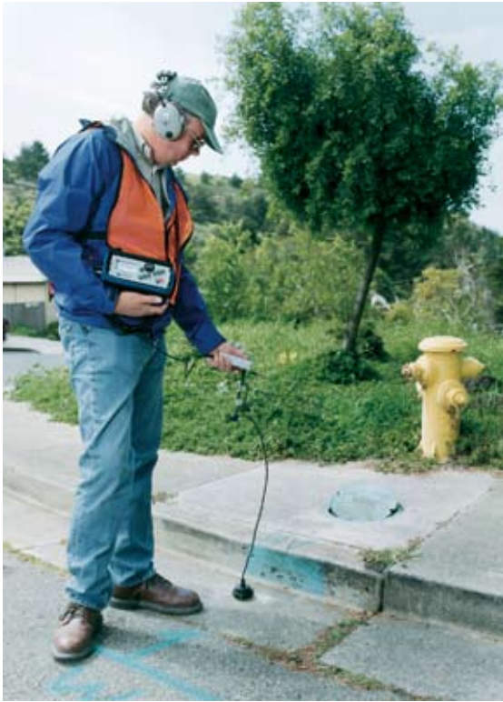
Ground Miking to pinpoint a leak in a hydrant line