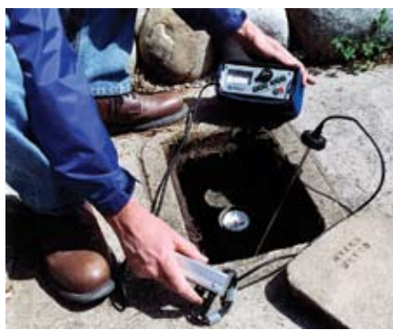
Leak Surveying by listening at a meter with contact rod