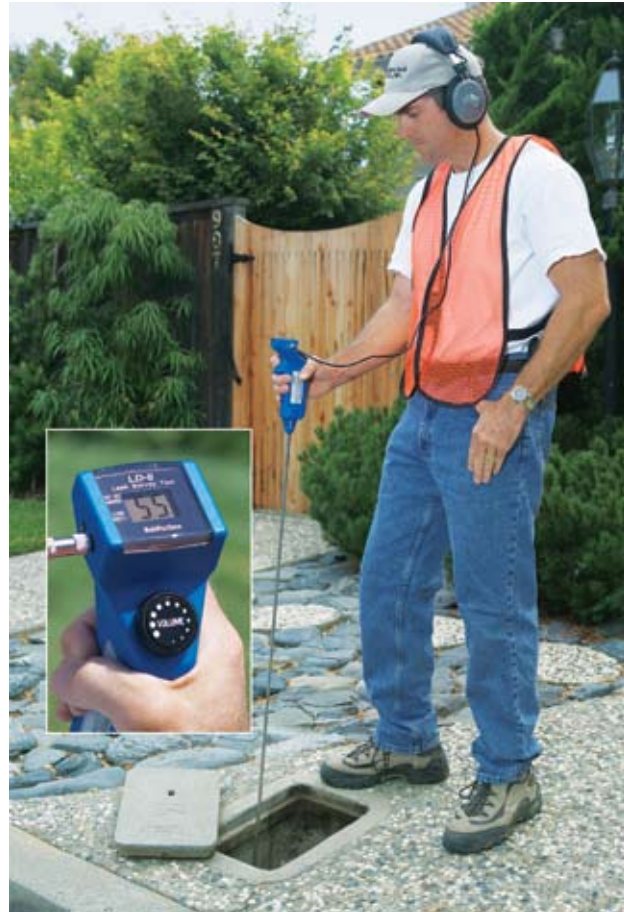
Listening at a Meter with Optional 40 inches Rod