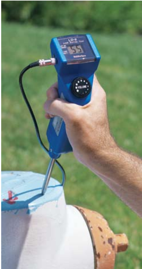
Listening at a Hydrant with a 4-inch Rod